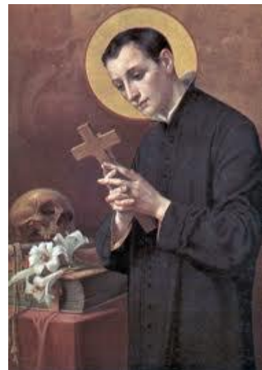
June 21 Feast Day of Saint Aloysius Gonzaga