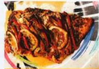
Smoked Salmon 1lbs $26